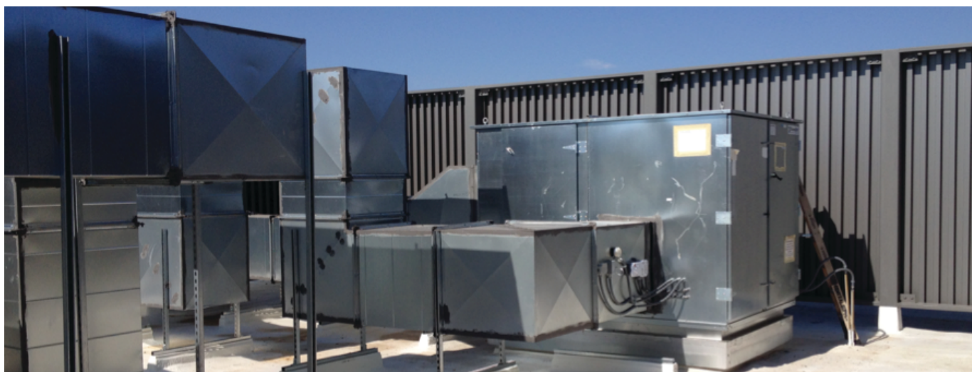
Rooftop installation of RenewAire ERVs at GCU

Faced with substantial ventilation challenges, the RenewAire ERVs were able to overcome these and achieve the following results: