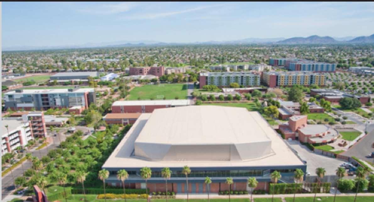
The campus of Grand Canyon University, Phoenix, Arizona