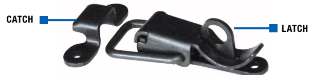
NEW LATCH ASSEMBLY