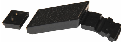
OLD LATCH ASSEMBLY

Replacement doors from RenewAire include upgraded latches that are to replace the older style latches. These new latches are to be field-installed when installing replacement doors. A hardware kit that contains a complete set of new style door latches and mounting hardware is provided.