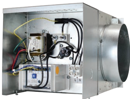
RH-D (Integral Thermostat)