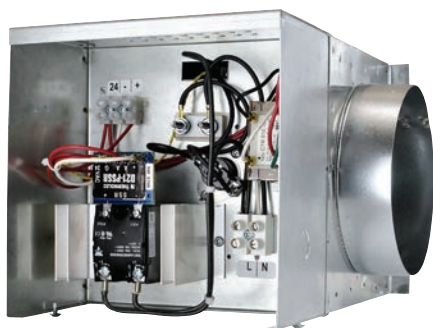
RH-W (Wall Mount Thermostat)

Heater Type: Electric Duct Heater Typical KW Range: 1-11.5 kW (1, 2, 3, 4, 5, 6, 8, 10, 11.5 kW) Voltages & Phase: Single phase - 120, 208 and 240V Control Voltage: 24 VAC